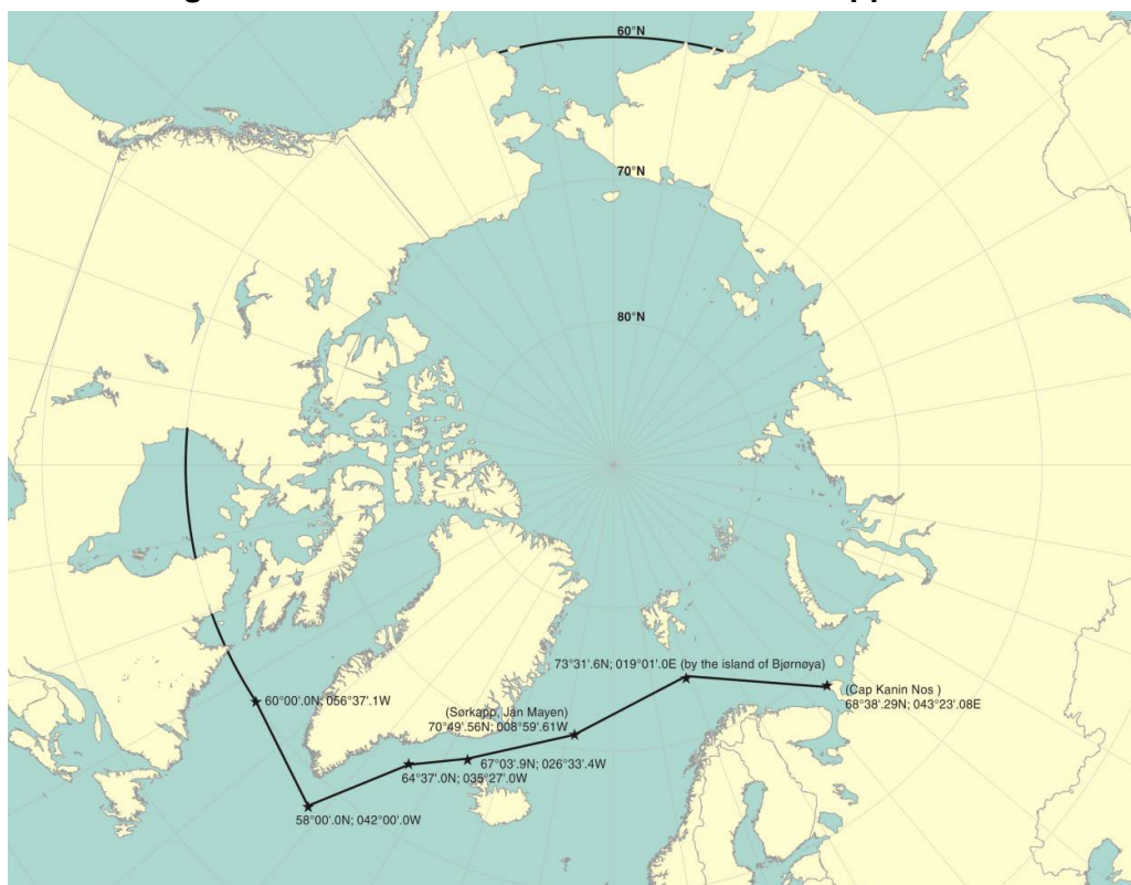
Figure 2 – Maximum extent of Arctic waters application